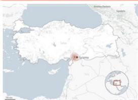
Pictured above: The location of the two earthquakes

The two massive earthquakes affecting Turkey and Syria have had a huge impact on the countries. At least 2,800 buildings are thought to have been destroyed and schools in 10 cities are to be shut for a week to keep people safe. Many airports have been closed as well. The earthquakes were also felt in other countries, including Cyprus, Lebanon and Israel.