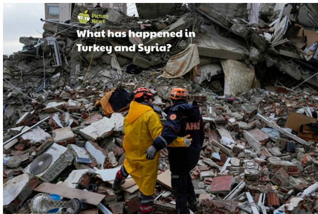
What has happened in Turkey and Syria?