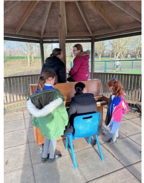
Sunrise outdoor piano lessons