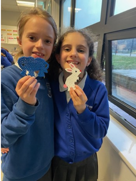
Hamma bead fun