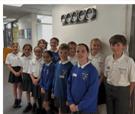
stamford.green Congratulations to our new Y6 Pupil Leaders! Our Head and Deputy Pupils will be involved in various public speaking events in the autumn... more