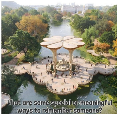
What are some special or meaningful ways to remember someone?