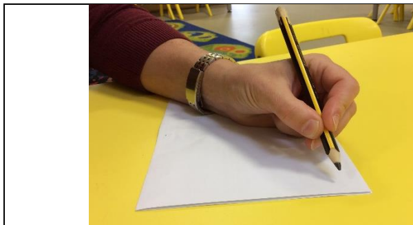
Tripod pencil grip for left hand

These assessments will inform planning to support children to develop correct pencil grip.