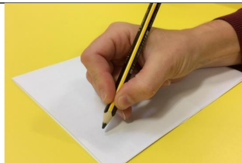
Tripod pencil grip for right hand