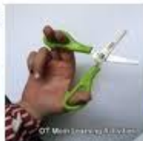
Two oval holes. Thumb through one hole; index and middle fingers through the other hole.