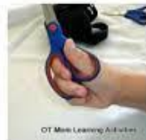
Round and oval holes. Thumb through round hole, middle and index fingers through oval hole.

Last week the children really enjoyed using scissors and practicing their cutting skills. This week we will continue this and practise holding the scissors correctly. It would be great if your child could also practise this at home.