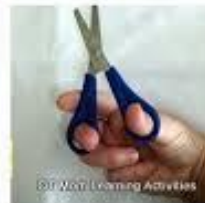
Two round holes. Thumb through one hole; middle finger through other. Index finger on outside for stability.