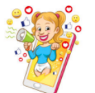
A Parent's Guide to Online Influencers