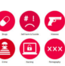
A Parent's Guide to Privacy Settings

Online safety is when young people know who they can tell if they feel upset by something that has happened online.