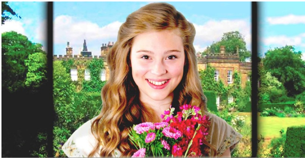
THE SECRET GARDEN OPEN AIR THEATRE PRODUCTION

Come to the main school office via the Christchurch Mount Entrance.